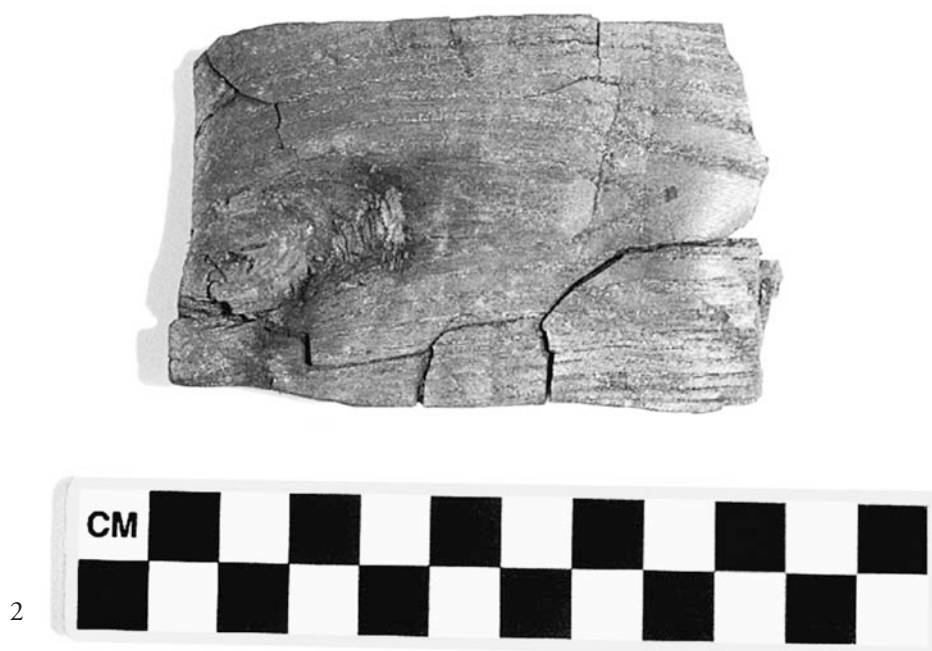
Fig. 2: 1. Mortise cut into a pine plank from the pillared hall of the Susi temple complex; 2. Tenon, cut from elm, from the pillared hall of the Susi temple complex.