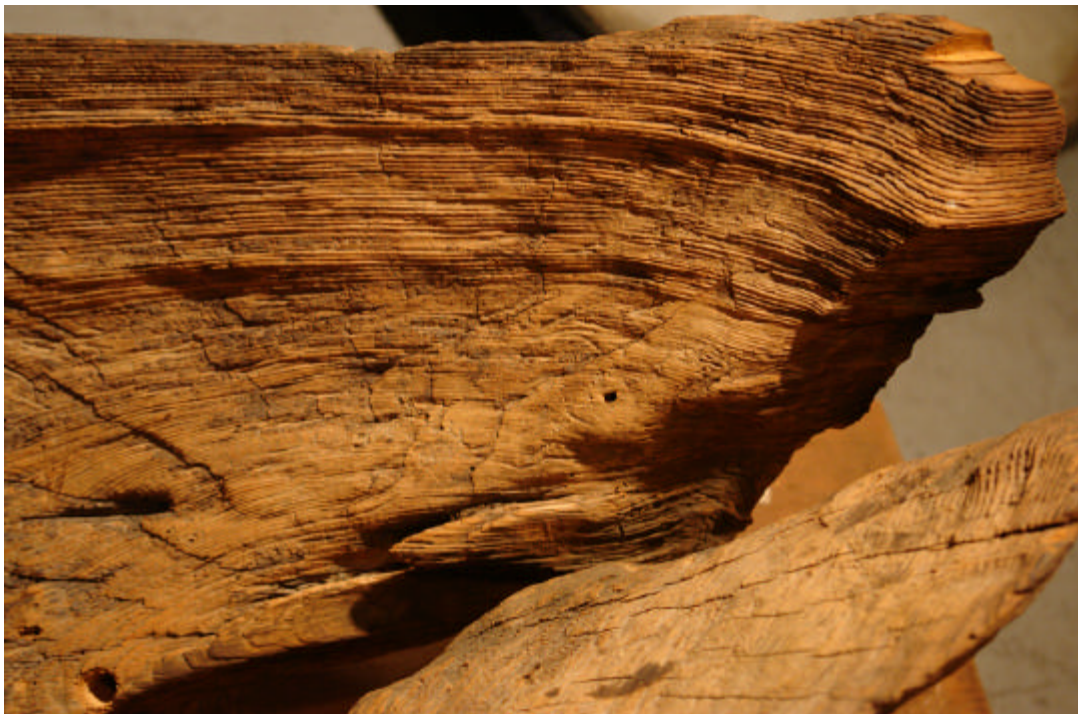
Figure 1. In this photograph, the retention of the latewood and attrition of the earlywood is clear on the inner surface of one end of the dugout. The center of the tree is at the bottom of the far side: the circular hole at bottom left is where the core was taken.

The Glass Lake Dugout was found at the bottom of Glass Lake in Rensselaer County, NY (42.65N 73.53W), and given to the New York State Museum in Albany, NY, in 1893 by Arthur C. Parker (NYSM records; JC Lothrop, pers. comm.). The canoe is 20.2 feet in length and had been made from about two-thirds of a large log of eastern white pine ( Pinus strobus L.), with the center of its beam (= bottom) being the center of the tree (Figure 1). It is the most fragile of the three dugouts in the New York State Museum collection in 2008. Its fragility is at least partially due to being sunk in a lake and not immediately covered entirely by sediments. The exposed wood would have been accessible to any aquatic organism at the bottom of the lake. The organisms consumed mainly the softer earlywood cells of each tree-ring, causing the fragility, but also causing the ring boundaries to be unusually evident in the dugout's current state, particularly in its inner surfaces.